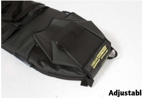
Adjustable foot cover