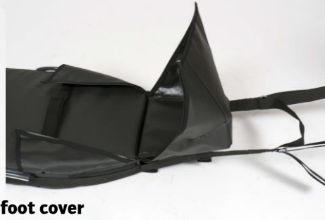
Adjustable foot cover